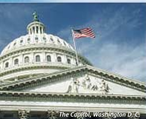
The Capitol, Washington D. C.

▶ Have you ever been to America? If you have, tell the class about some of your experiences. Which images come into your mind when you hear the word America ?