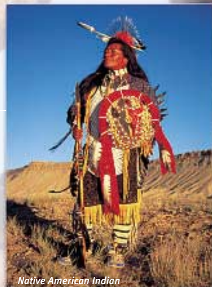
Native American Indian

A t the beginning of the 1600s, Indians welcomed and helped the early settlers in America. But the Europeans took land from the “Redskins” and massacred thousands of them. Until very recently – 1924 – Indians were not allowed to become American citizens. Today Indian culture fascinates more and more people and there are Native American festivals all through the year, where visitors can buy traditional art work and watch Indian ceremonies.