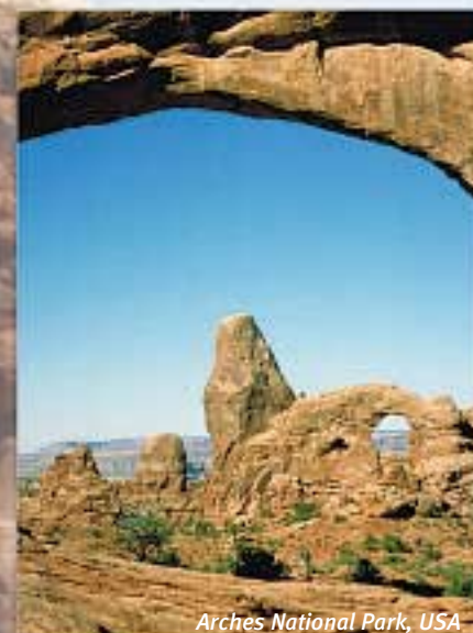
Arches National Park, USA

W e’ve probably all seen films with car chases through the hilly streets of San Francisco. The crowded cable cars, the elegant houses and the Golden Gate Bridge are familiar to us even if we have never been to San Francisco. But the main attraction for 87% of the tourists in San Francisco is Fisherman’s Wharf, where the restaurants serve freshly caught fish and a special kind of local bread. Tourists can also enjoy boat trips around the harbour – or sail the 2 kilometres to the old prison island of Alcatraz, where Al Capone was in prison.