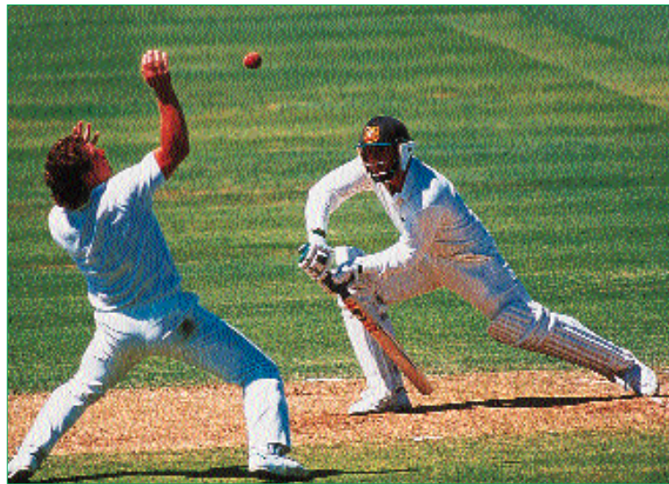
Cricket is one of the strongest ties between Commonwealth countries. Australia, India, New Zealand, Pakistan, South Africa, Sri Lanka, the West Indies, Zimbabwe and England all play regular international matches

40 BHUVAN We have found our 11th player. Come, Kachra, Isar Kaka, you'll face him. Goli, give Kachra the ball. Arjan,